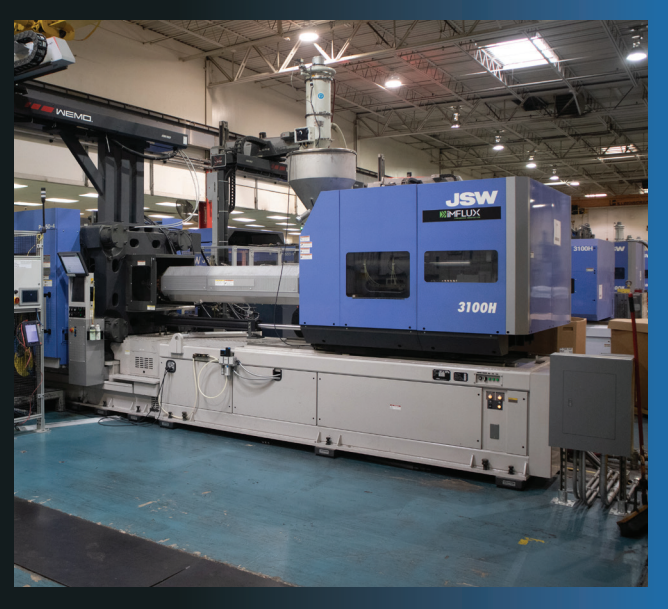
Injection Molding: Specially designed molding technology that allows for precise shot-to-shot repeatability.